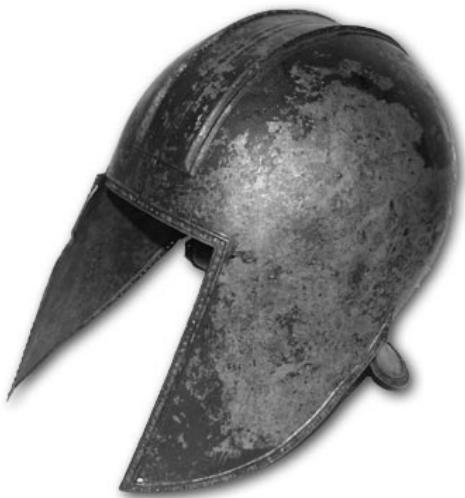
ILLYRIAN HELMET iron 6 th century BC