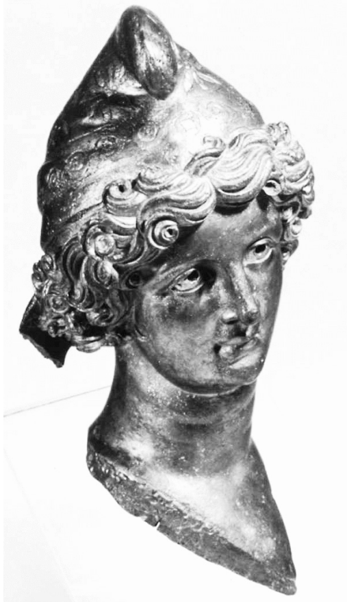
THE HEAD OF ORIENTAL GOD (ATIS?) bronza 2 nd century AD SISCIA (modern Sisak, Croatia)